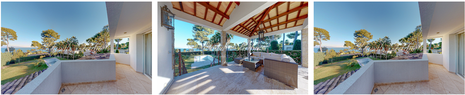
Villa / Property - Cap d'Antibes - France